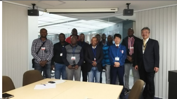
Date: 2017 Nov. 29 / TEPCO PG Training Center