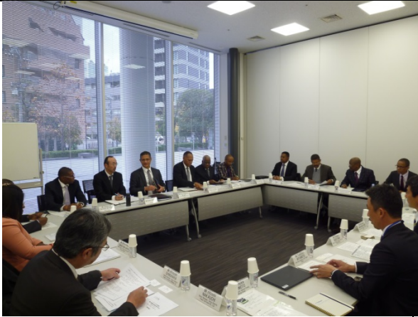
Date: 2018 Dec. 10 / Kick-off meeting (in JICA Head Quarter)