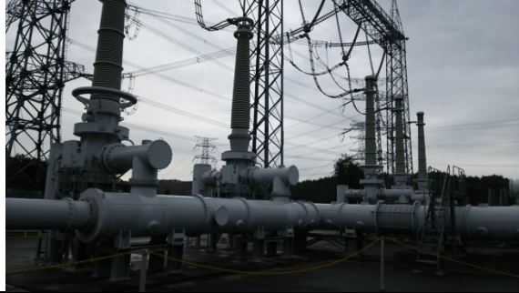
Date: 2017 Dec. 1 / Mitsubishi Hitachi Power Systems, Hitachi Mitsubishi Hydro Corporation Hitachi Works