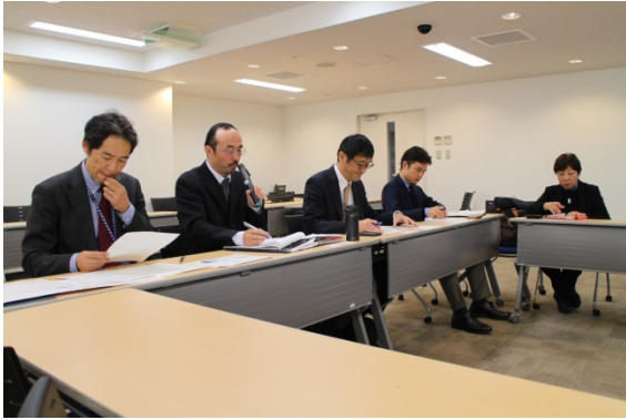
Date: 2017 Nov. 28 / Kick-off meeting (in JICA Ichigaya office)