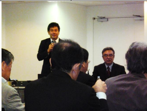
Date: 2018 Dec. 11 /TEPCO FP Kawasaki Thermal Power Plant