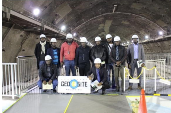
Date: 2017 Dec. 7 / TEPCO PG Shin-Shinano Frequency Converter Station