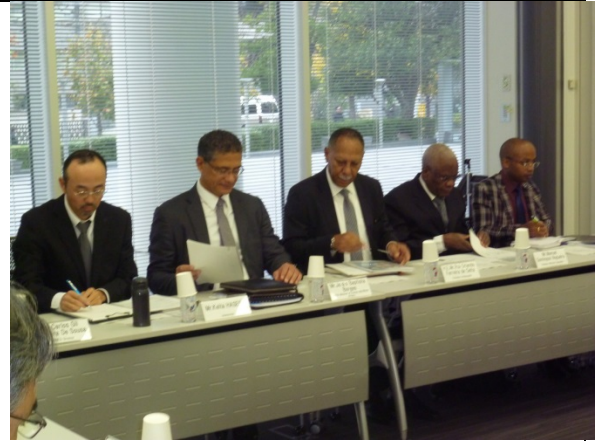
Date: 2018 Dec. 10 / TEPCO PG Central Load Dispatching Center